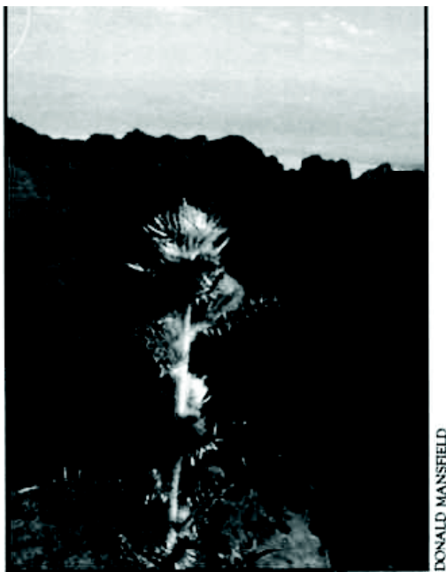
Steens Mountain thistle ( Cirsium peckii )

To understand the distribution of rare plants on Steens Mountain, vegetation can be divided into three zones — the low desert (below 4,200 ft. or 4,600 ft. in the Catlow Valley montane (4,200 ft. to 8,200 ft.), and alpine (above 8,200 ft.).