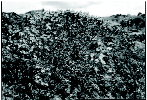
Steens penstemon ( Penstemon davidsonii var. praeteritis )

The plant taxa found on Steens Mountain that the ONHP (1993) considered rare, threatened, or endangered are summarized in Table 1. Though Steens Mountain is a center of high plant species diversity, none of the vascular plant taxa of Steens is listed as either endangered or threatened at either the Federal or State level. Only 2 taxa ( Castilleja pilosa var. steenensis and Lupinus biddlei ) are candidates (C2 status) for consideration, meaning that they require "active protective measures to